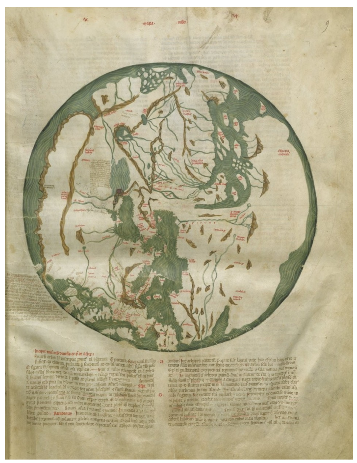
Fig. 12. Mappamundi above De Mapa Mundi text