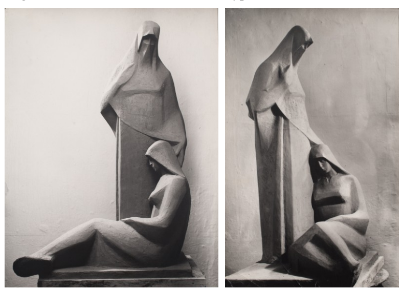
Fig. 5. Nazem Irani. Sorrow, 1966. Gypsum, 137 x 90 x 75 cm.