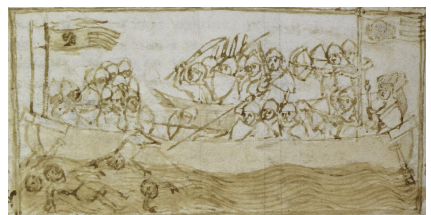
Fig. 10. Battle of Jaffa or Siege of Tyre