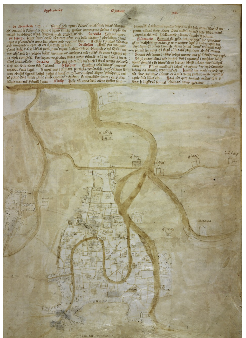
Source: © Biblioteca Marciana, Venice, Chronologia Magna, Zanetti Latino 399, fol. 7r.

In Zanetti Latino 399, Paolino's Linea regularis on 6r. (and 7r.) and the corresponding gloss on 7v. above the marvelous Medieval map of Venice, depict