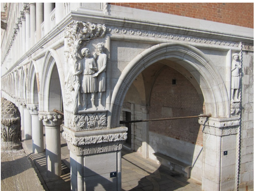
Fig. 15. Japheth, Shem, and Ham , 1340-65, Doge's Palace (southeast corner), Venice.

Valorizing Venice: Art and the Production of an Early Modern Mediterranean