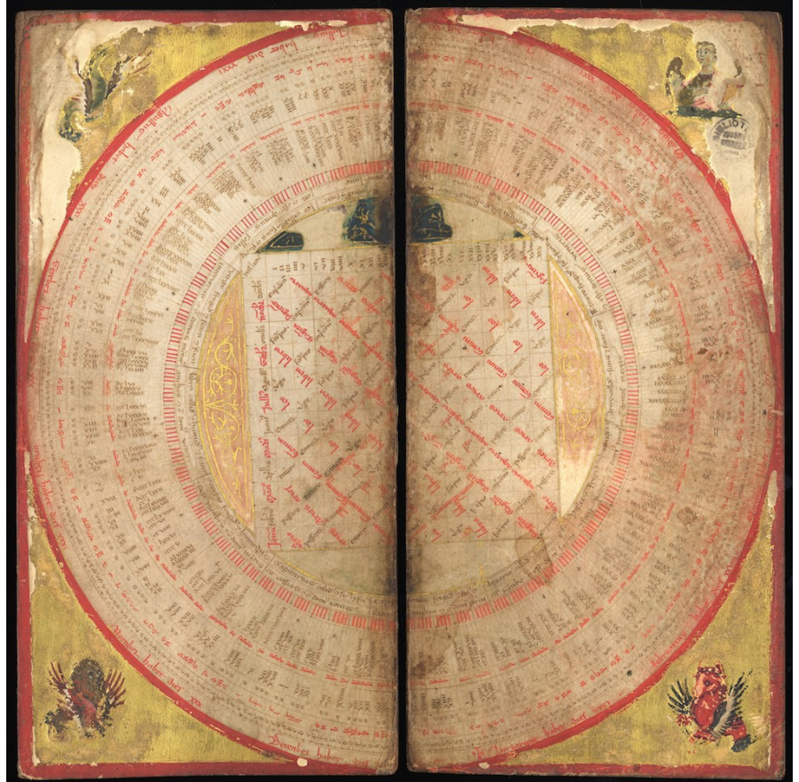
Fig. 16. Pietro Vesconte, Calendar page of Atlas, 1318.

Vesconte's calendars and the palace capital associate human activities on earth with the movements of celestial time and space. Not only were these celestial