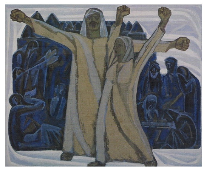
Fig. 6. Abdel Mannan Shamma. Palestinian Refugees, 1969. Oil on canvas, 100 x 120 cm