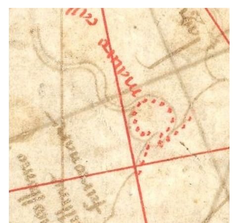
Fig. 3. Vesconte, Atlas, 1313. Detail, Black Sea

Throughout the charted territory on the 1311 map, as well as on his later atlases, Vesconte uses a fixed set of symbols to mark topographical features, including rivers and dangers to nautical navigation. For instance, he designates shoals with red stippling, a practice not seen on the Carta Pisane, but widely used on subsequent Early Modern nautical charts.