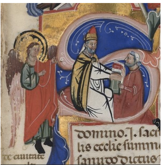
Liber secretorum, 1321. Lat. 2972 (hereafter Vat. Lat. 2972).

Fig. 4. Marino Sanudo giving his text to Pope John XXII as depicted in the Liber secretorum.