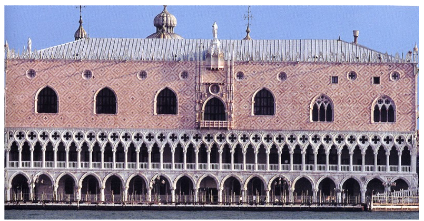
Fig. 1. Trecento facade of the Doge's Palace facing the Venetian Lagoon, 1340-65