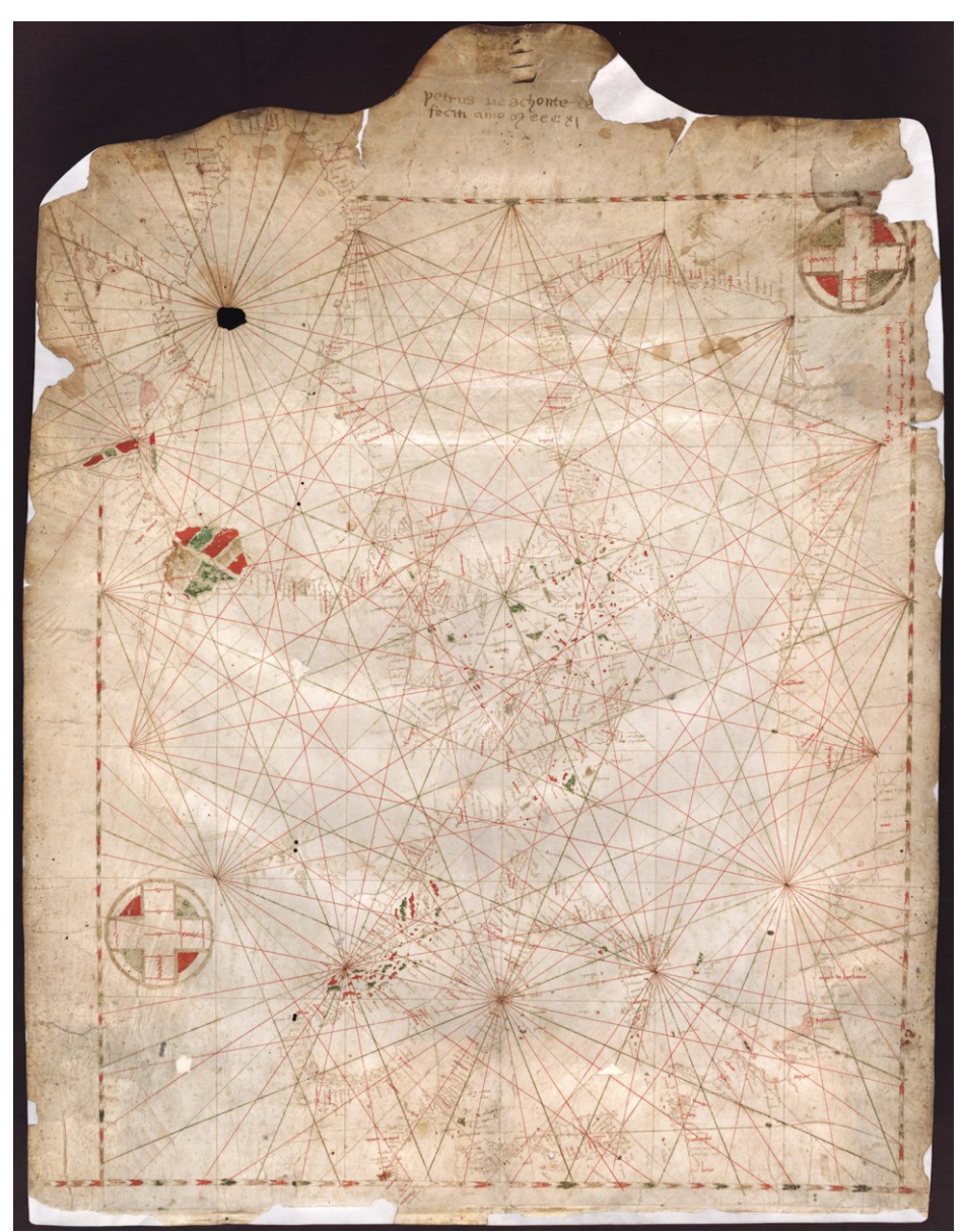
Fig. 2. Pietro Vesconte, Nautical chart, 1311.