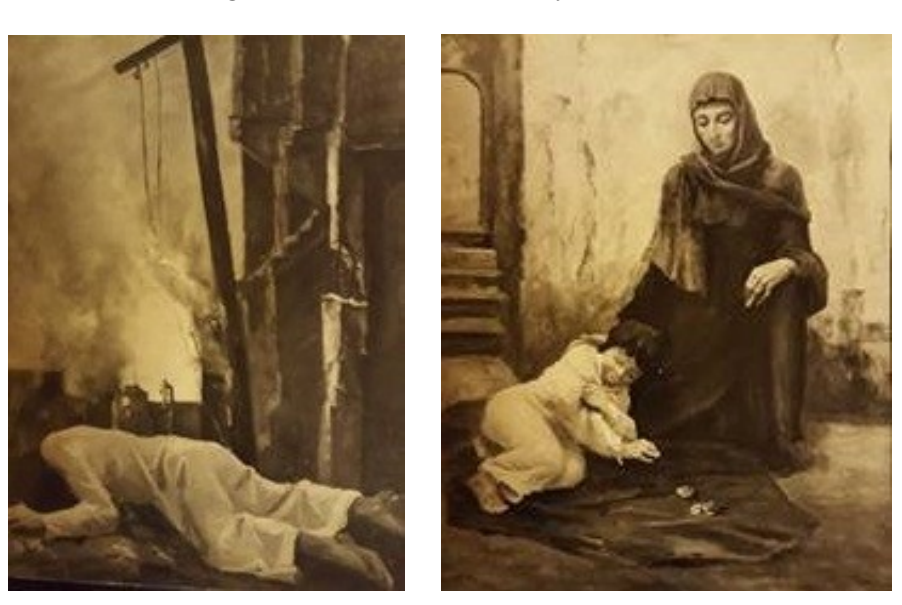
Fig. 7. Zuhair Al Tall. Series of artworks.