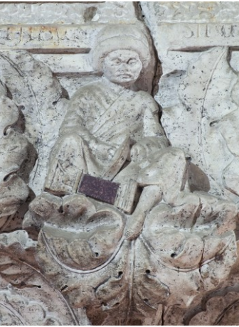
Fig. 21. Tartar disciple , G19, original and copy, Doge's Palace, Venice.