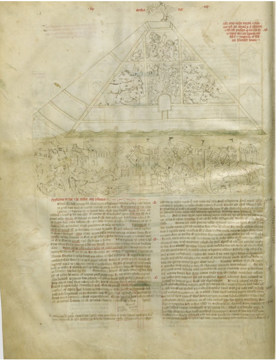
Fig. 11. Fra Paolino, Noah's Ark