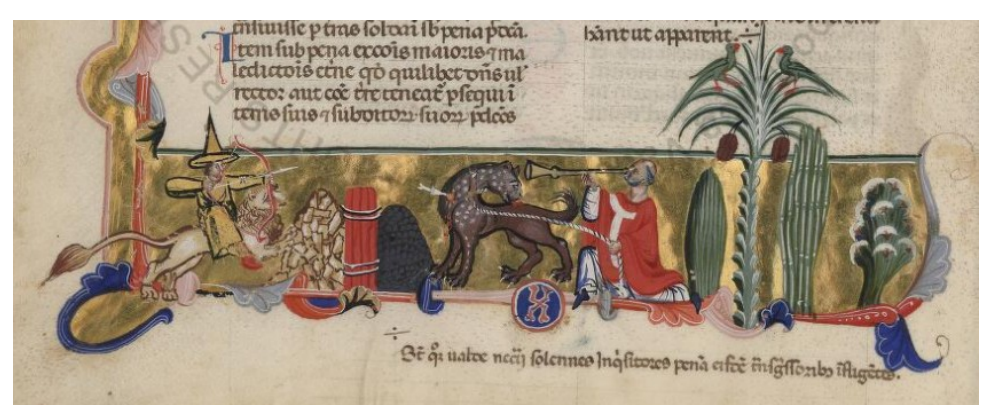
Fig. 18. Mongol riding a lion shooting arrows at a panther held on a rope by a cleric.

Correspondingly, folio 7v. of Vat. Lat. 2972 of Sanudo's Liber secretorum , includes a Mongol, armed with his infamous bow, valiantly riding in on a lion to