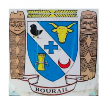
Fig. 1. The coat of arms of Bourail city

The Algerian descendants in New Caledonia reflect this interculturation process and rhizomatic identity, sometimes also be noticed at the institutional level such as in Bourail city's coat of arms. Bourail city hosted the majority of lands given by the French colonial administration to Algerian detainees and its coat of arms articulates these affiliations (figure 1): "[It] bears witness to the ancestral Kanak presence through its two door frames. The crescent moon explains the origin of the first occupants of Bourail. These were the freed Algerian convicts" (Ouennoughi, 2005, p.79). Other elements represent the New Zealand cemetery (blue cross), the Moluccas blackbird introduced in New Caledonia from Bourail city (bird with yellow legs) and the Bourail agricultural communities (cattle head and wheat sheaf).